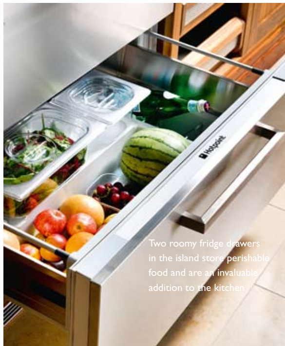
Two roomy fridge drawers in the island store perishable food and are an invaluable addition to the kitchen